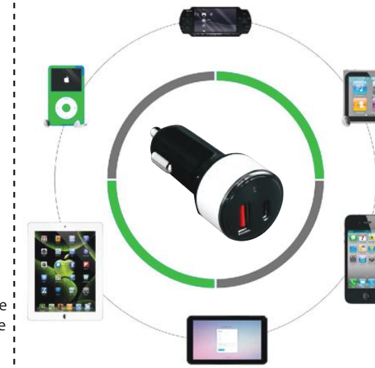
Product pictured in this manual is for demonstration purposes only. The actual product may be different.